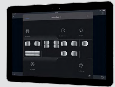
Reliable cabin controls