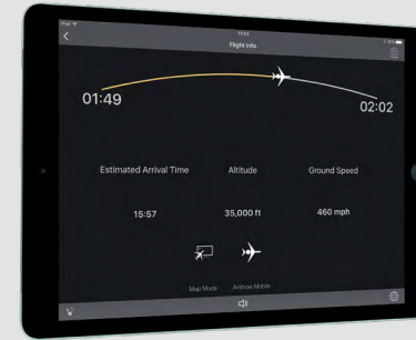
Intuitive flight information

When paired with Ka-band which offers the fastest internet connectivity available worldwide*, users can seamlessly stream and mirror content straight to high-definition monitors just like at home.