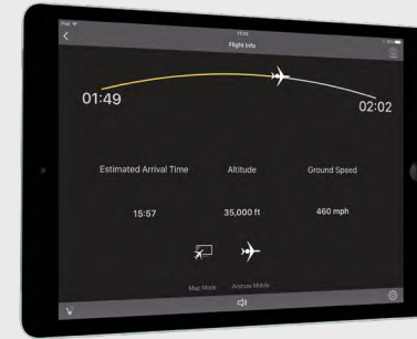
Intuitive flight information

When paired with Ka-band which offers the fastest internet connectivity available worldwide*, users can seamlessly stream and mirror content straight to high-definition monitors just like at home.