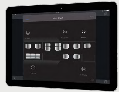
Reliable cabin controls